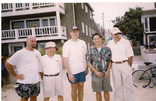
Thanks CHLA Doctors and Technicians!