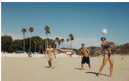
Holly McPeak & Players-Zuma-Chad 2001