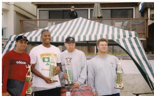
Volleyball Tourney Winners - 2ndPl -.Chad 11th